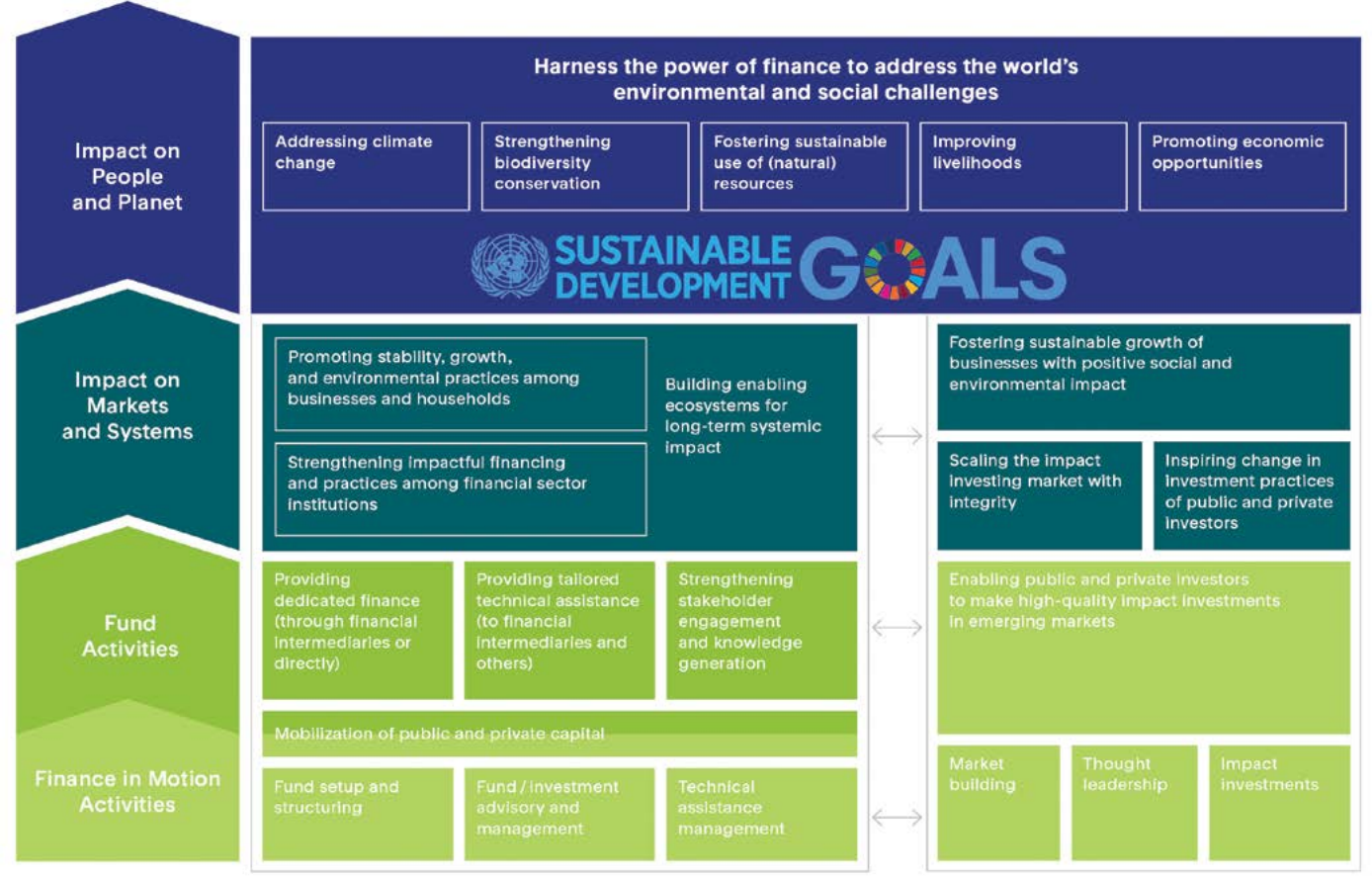
Figure 1: Finance in Motion's Pathway to Impact

Founded in 2009, Finance in Motion is a long-standing member of the impact investing community . In addition to being a signatory of the Operating Principles for Impact Management, Finance in Motion is a signatory to the UN Principles for Responsible Investment (UN PRI) and a member of the GIIN Investors' Council. In 2024, ImpactAssets 50 (IA 50), an annual investor database that features a diversified listing of private capital impact fund managers, named Finance in Motion as an Emeritus Impact Manager for the third consecutive year, recognizing Finance in Motion's inclusion in the IA 50 for at least five years.